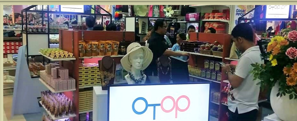
(Photo above) Visit the OTOP Ph Hub at the Home and Fashion Department of Island City Mall in Tagbilaran City, Bohol. A wide range of local and regional products from processed food, fashion accessories and homewares are available